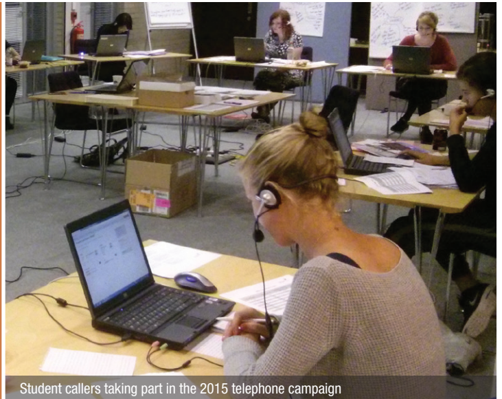
Student callers taking part in the 2015 telephone campaign