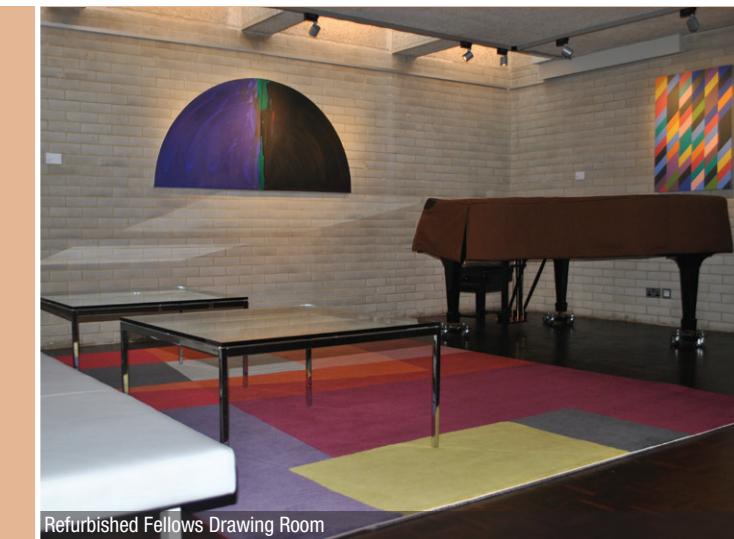
Refurbished Fellows Drawing Room

Similar crucial refurbishments have been completed in the Fellows Offices located in Fountain Court South, ensuring a comfortable working space for teaching and supervisions.