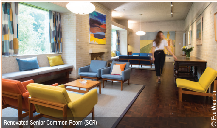
Renovated Senior Common Room (SCR)

Improvements in Orchard Court include new curtains, heaters and floor coverings. These changes may seem small, but they make the student rooms a brighter and more welcoming space to study and call home. The Fellows Drawing Room and Senior Common Room have had a full makeover, with new artwork, refreshed upholstery and soft furnishings, along with a full technical upgrade of heating, lighting, electricity, plumbing and a new fire alert system.